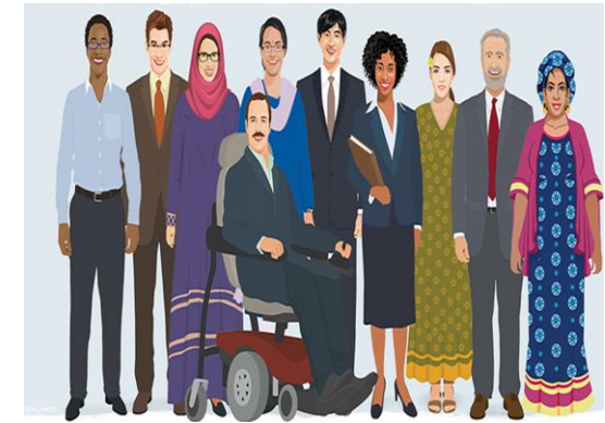
Professional Education for SAI Auditors – Pilot